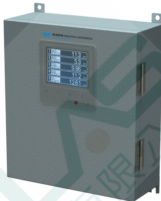
NEMA-4 Wall-Mount Configuration

The concentration of the desired gases is displayed on a large, easy-to-read back-lit LCD. The user interface is very intuitive and the menu / mode selection buttons, which are readily accessible, provide the operator with dynamic control and extensive diagnostic capabilities.