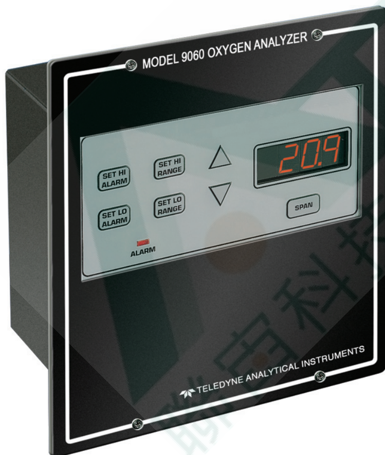
9060L Low-Cost Controller

The 9060Z O 2 analyzer / transmitter provides in-situ analysis capability which can accept signals from up to two zirconia probes for averaging or backup purposes in furnaces, kilns, and boilers with sample temperatures ranging from ambient up to 1400° C. This unit is provided within a compact, steel, IP-54 (IP-65 without internal air reference pump), easily installed, gasketed enclosure suitable for wall mounting. Purged or explosion proof design enclosures rated for hazardous areas can also be supplied.